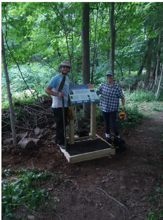
The Bye Preserve station was installed by staff and interns on June 22 nd