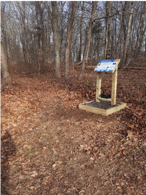
The Lawther Preserve station was installed by staff and volunteers on November 21 st .