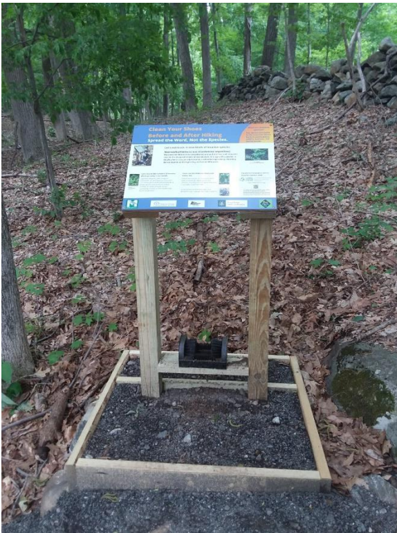
The Armstrong Preserve station was installed by high school interns and staff on May 27 th .