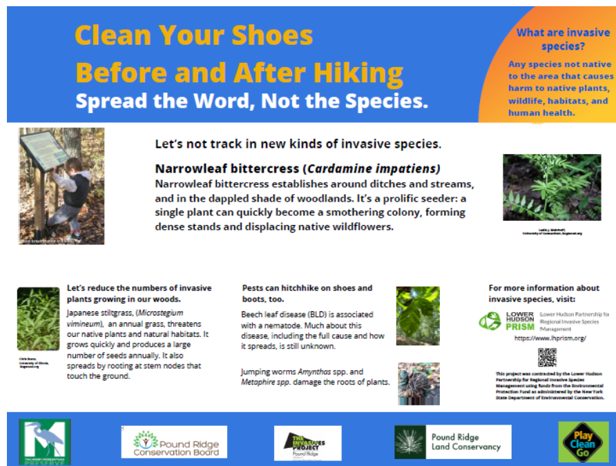
Figure 2. Educational Sign for Boot Brush Stations

promote PlayCleanGo (Goals 5.F.2 & 5.F.3) and encouragement to avoid transporting pests like beech leaf disease (Goals 5.C.2 & 5.C.4).