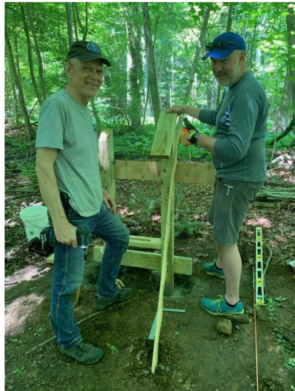
The Halle Ravine Station being installed by volunteers during the June 5 th work session.