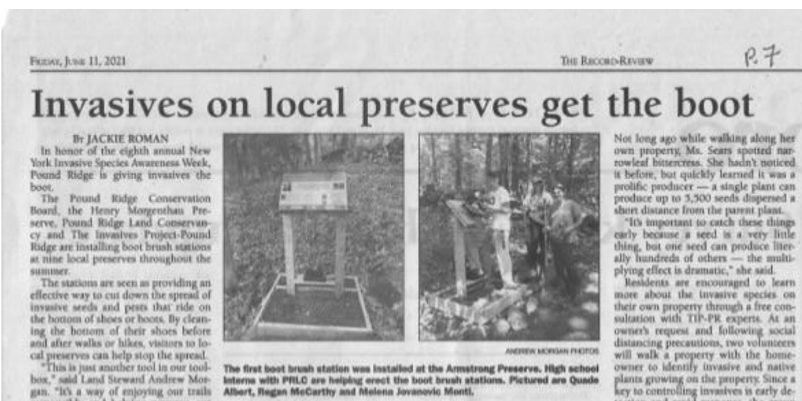
Figure 3. Snip-it of Record Review Article about the Project.

The first five station installations were timed in conjunction with NYS ISAW in June and our other related events occurring that week. These installs were promoted on our social media outlets and in our local newspaper (see figure 3). Three additional stations were built over the course of the summer by PRLC's Land Steward and summer interns, whose stipends were partially supported by this grant. The last station was installed in November at the town's Lawther Preserve. The entire project included 1 PRLC staff, 9 volunteers, 3 high school unpaid interns, and 2 paid summer interns, plus 3 others from collaborating organizations who promoted and worked on sign design.