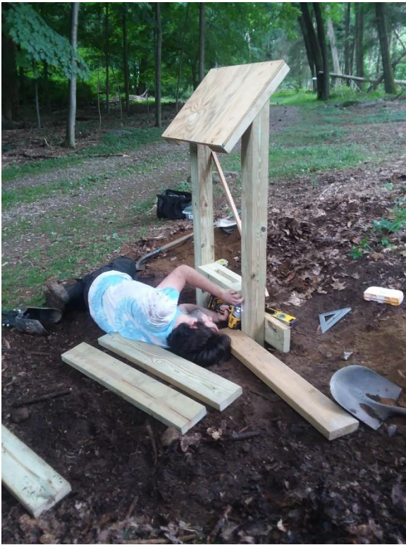
The Carolin's Grove station being installed by interns and staff on June 22 nd .