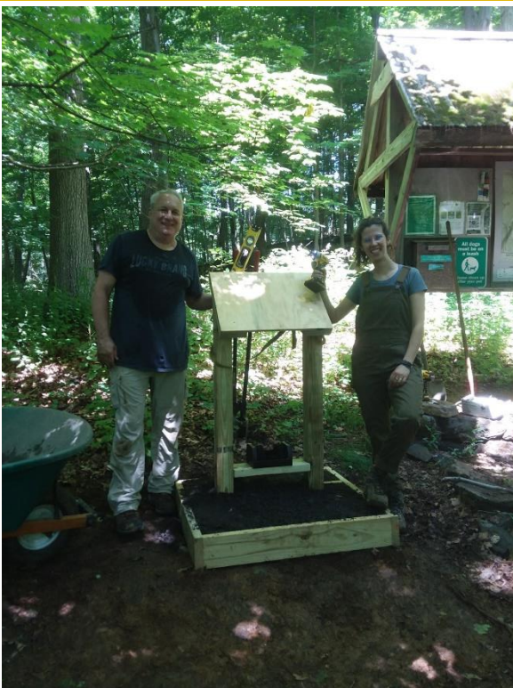
The Clark Preserve Station being installed by staff and volunteers during the June 5 th work session