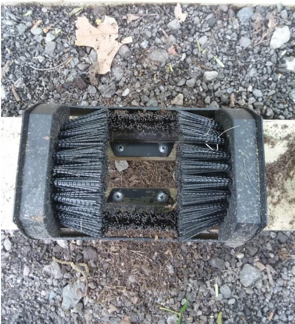
The Eastwoods Preserve station was installed by volunteers during the June 5 th work session. All brushes have been in use as evidenced by dirt accumulation and plants sprouting below brushes.