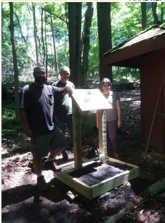
The Henry Morgenthau Station being installed by volunteers during the June 5 th work session