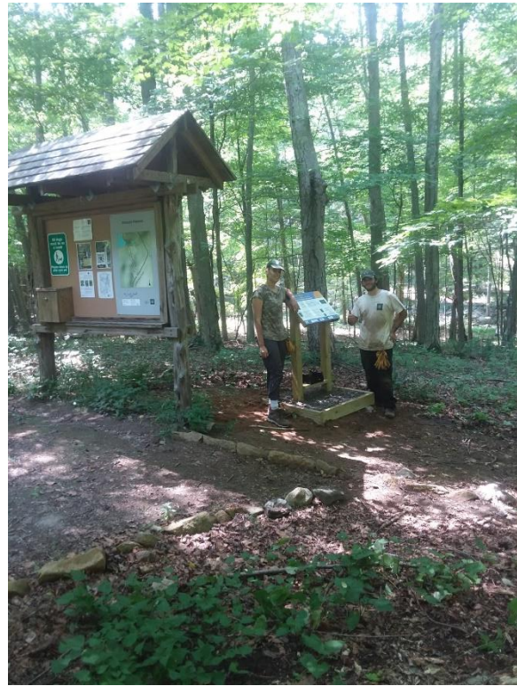
The Richards Preserve station was installed by staff and interns on July 6 th .